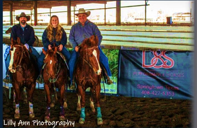
Lilly Ann Photography